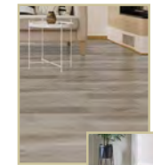
LVP Whitfield Grey