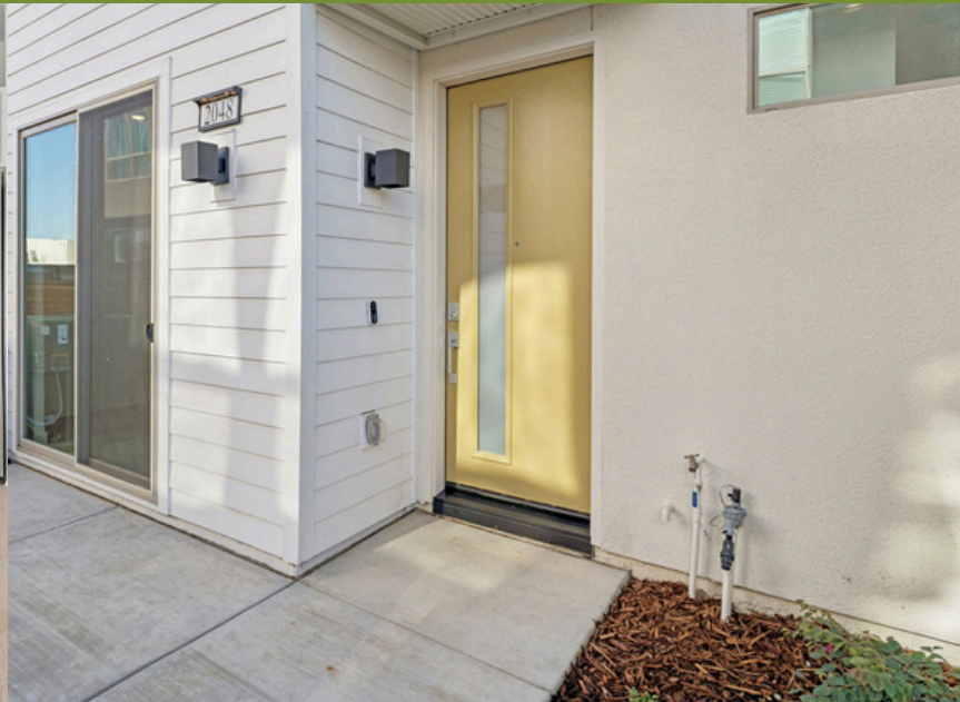
Image has been digitally altered to show how the space could be used. View the original, non-modified image here: https://bit.ly/NGC-NP-Lot20