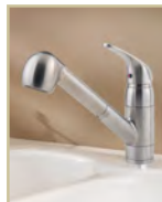
Price Pfister Faucet