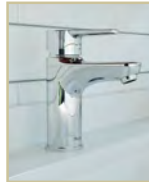
Price Pfister Faucet