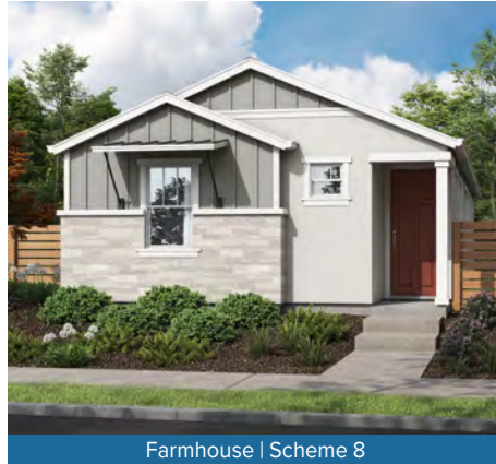
Farmhouse I Scheme 8

Single-Story Home 3 Bedrooms, 2 Baths Approx. 1,196 sq. ft.